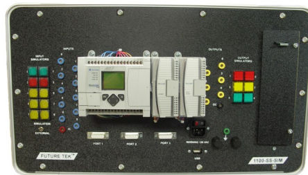
Future Tek Model 1100-SS-SIM

Future Tek, Inc's –SIM series includes Festo MecLab ® connection AND Festo EasyVeep ® Simulation Software connection. The Festo EasyVeep ® Software provides interactive PLC control of real-world processes through simulation.