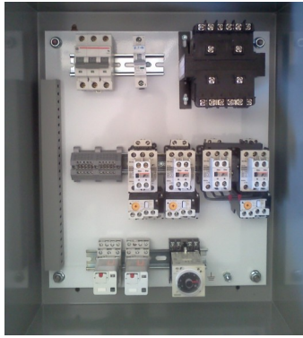
Control Panel Interior